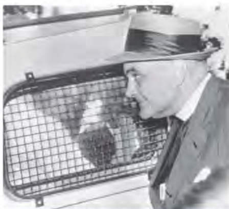
Eugene Carson Blake entering a police van after being arrested at Gwynn Oak, 1963.