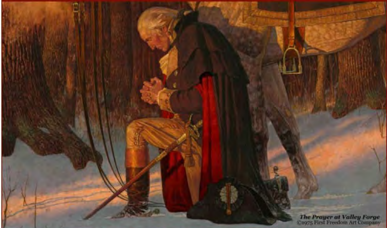
The Prayer at Valley Forge